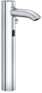
*RAK12041 Chrome Finish